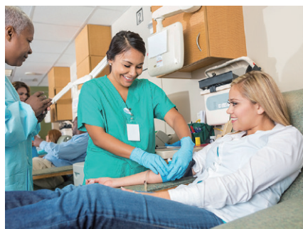
Hospital Collection blood center